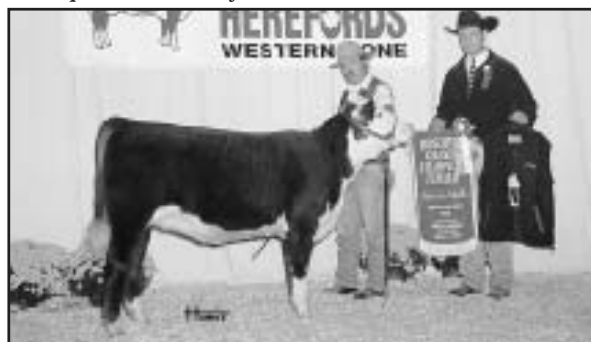
Sandy Ridge Livestock, West Lorne, exhibited the reserve grand champion female, SRF Sabre's Keynote 41M.