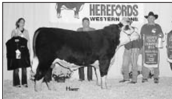
Sandy Ridge Livestock showed the reserve grand champion bull, Corey's 5H Hitter 138L.